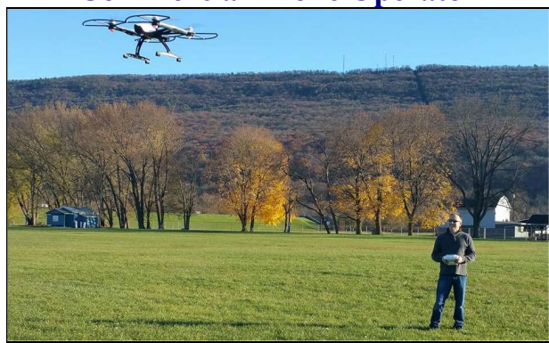
For as little as $1000 (including taxes), earn your FAA Remote Pilot Certificate with a Small Unmanned Aircraft System rating. Quarterly classes. Call now to reserve your seat in our next course.